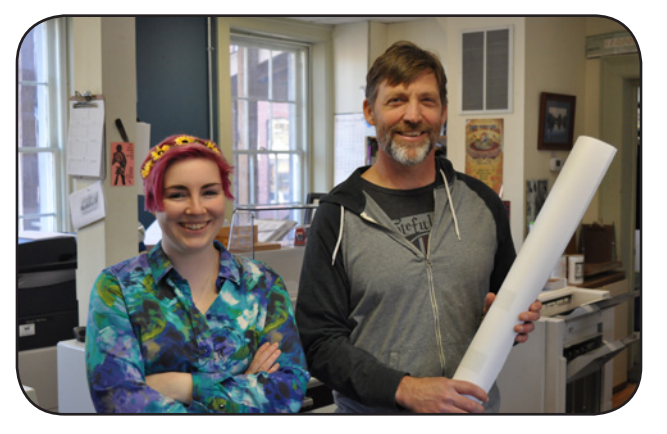
Members of Collective Copies celebrating owning their wide-format color printer after their last payment is made.