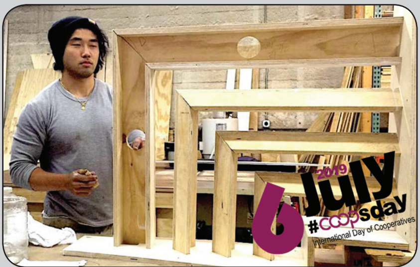
Oxbow was part of our International Day of Co-ops promotions.

Oxbow chose Shared Capital Cooperative for their loan. Shared Capital has 40 years experience of being a co-op themselves that only lends to co-operative businesses.