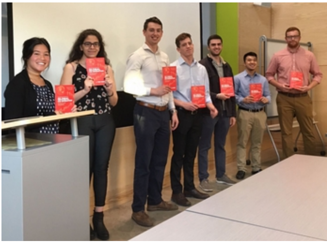
VAWC and NFCA hosted nine interns this past year through the Spring and Summer sessions

Power and talked about how co-ops root jobs and wealth, are centers of democracy and education and achieve larger social, economic and political change through federations. Highlights included discussing Collective Copies, Co-op Food Stores, Real Pickles, Old Creamery Co-op, Shared Capital Cooperative, Cooperative Fund of New England and New England Farmers Union.