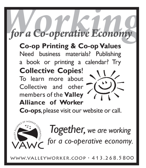
One of the twelve ads in Brattleboro Food Coop's Newsletter featuring VAWC members.