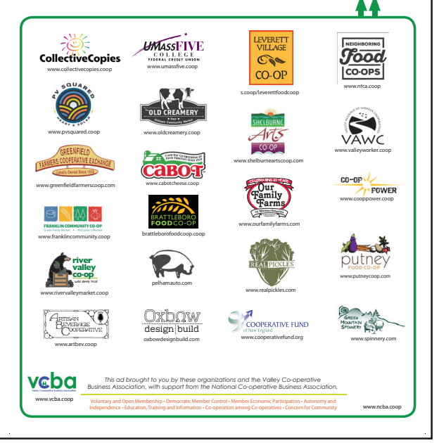
National Co-op Month's shared print ad by VCBA promoted cross sector collaboration in our region and included VAWC and many VAWC members.

Joinus! Valley Co-operators for our Annual Social on Saturday, October 14th at __ pm at Shelburne Falls Bowling Alley.