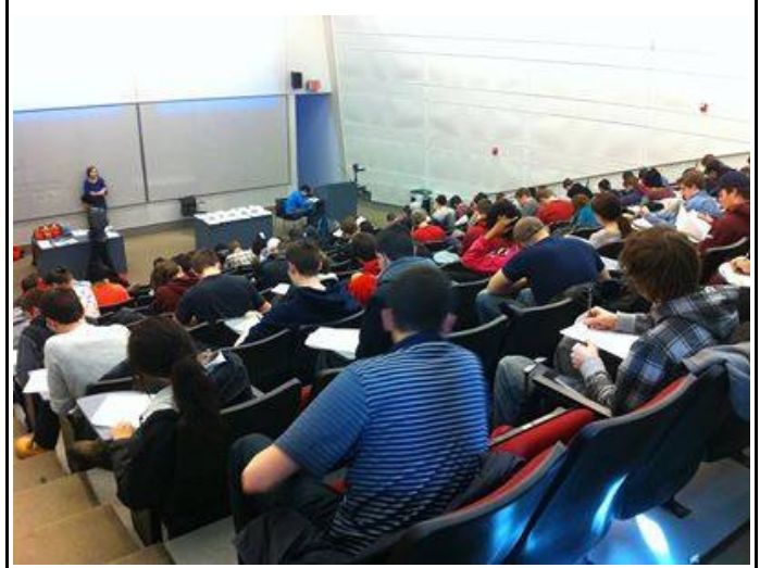
100+ Students taking their mid-term exam about cooperatives in our Certficate in Co-operative Enterprise

In an effort to support the needs of worker co-ops in our region and develop curriculum for students to learn about the nature and benefits of worker co-operation, VAWC cofounded the UMASS Co-operative Enterprise Collaborative