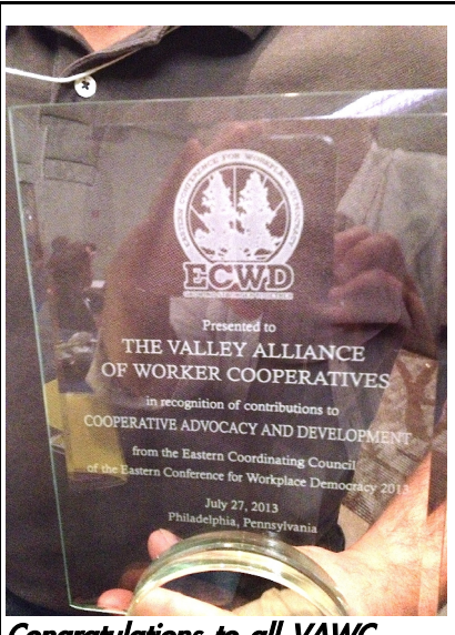
Congratulations to all VAWC Members! VAWC won the 2013 Award for Cooperative Advocacy and Development from the Eastern Conference for Workplace Democracy.

ALSO the number of awards we received this year!